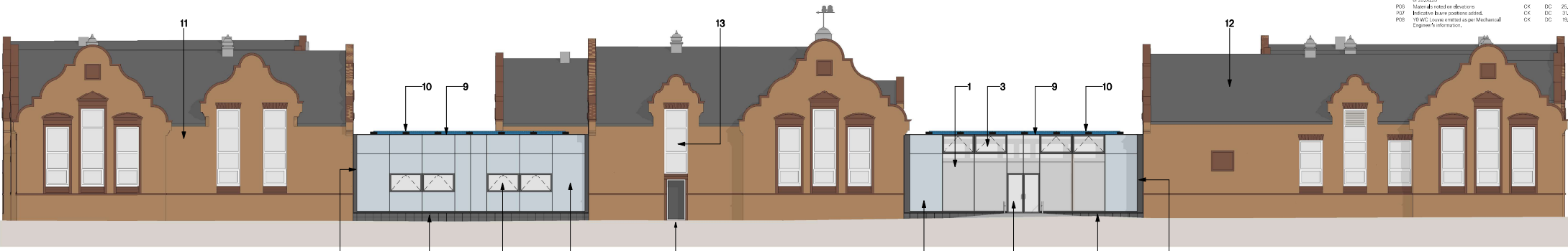
GA Elevation - Oxbridge Lane - Proposed (North) 1:100

Note: PPC/PVF2 coated steel faced door and frame.