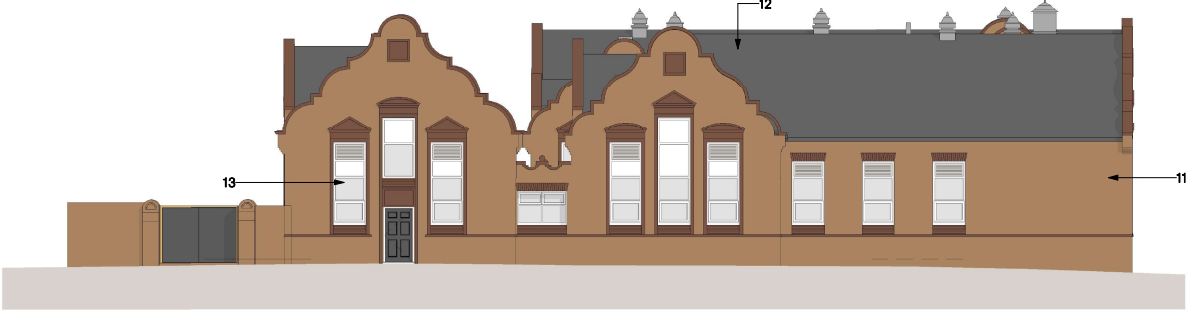
GA Elevation - Marlborough Lane - Proposed (East) 1:100

Note: PPC/PVF2 coated steel faced door and frame.